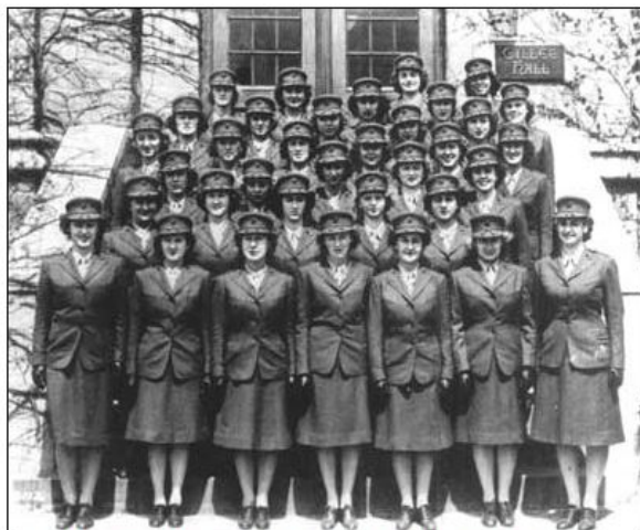
The 1st Platoon, U.S. Naval Training School (Women's Reserve), gathered at Hunter College in New York City, April 1943. Because uniform shipments were delayed, only the women in the first row and a few in the second wore uniform skirts.