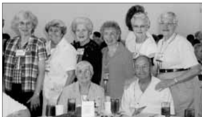
WI-1 at the National Convention.