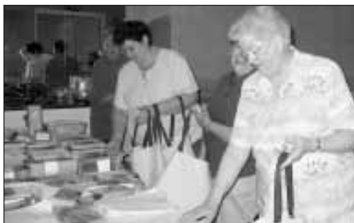
Getting the ditty bags ready to go. (June)