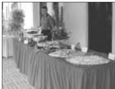
Breakfast at the Commanding General's house (June)