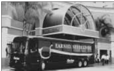
The MCRD VIP bus sitting in front of the Westin Horton Plaza. (Sondra)