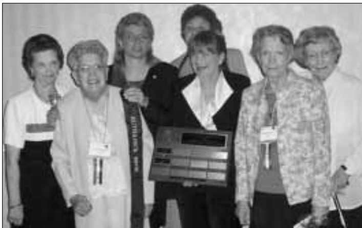
TX-2 with the Ruth & Dick Broe Award.

The TX-2 chapter of the WMA had a great summer. We had wonderful attendance at the meetings, and a few new faces joined us for a great time of fun and fellowship...work too.