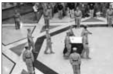
Above: Marines honoring 229 years of our Corps in a palace in Baghdad. OORAH!