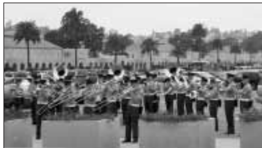
The MCRD band (June)