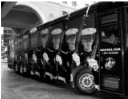
The MCRD bus (June)