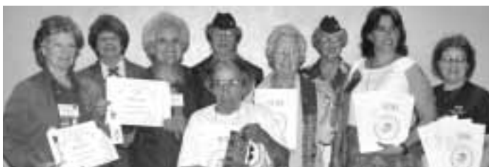
Everyone's a winner, but here are the few who actually showed up for pictures after the luncheon. (Sondra)