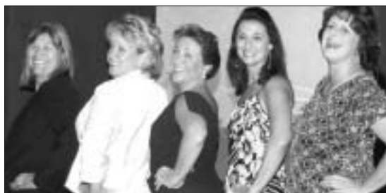
Better keep our eye on this group!