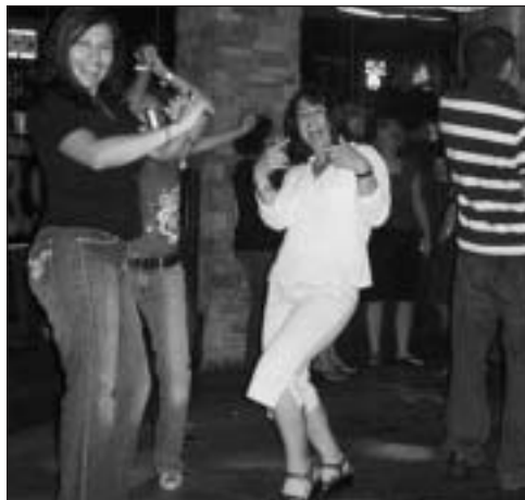
At the Hard Rock Cafe...

What do the active duty Marines do after hours when convention programs are wrapped up for the day? They go out on the town... At Joe's Crab Shack.