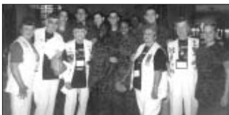
Members of MI-1 at the convention with members of a local MCJROTC.

The annual meeting of Michigan-1 was held in Owosso at J. Olivers on 16 September. Social hour started at noon, lunch was served at 12:30 after which the business meeting was called to order by the