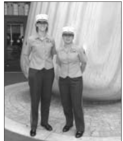
At the Louisville Slugger Museum