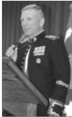
The General acknowledges the honor.