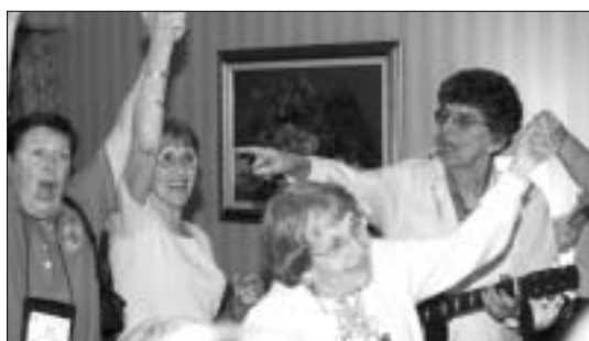
A rousing time in the Hospitality Suite.