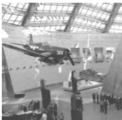
Views inside of the new National Museum of the Marine Corps at a "soft" opening attended by the Commandant and a host of other VIPs in October 2006.