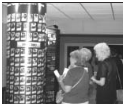
The Tennessee Valley Health Care System display attracted a lot of attention.