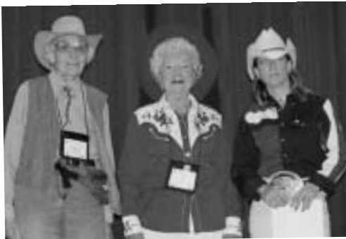
The best dressed Texan "wannabes".

All you had to do was walk into the ballroom. Between the festive Texas cowboy boots, wildflowers and oil rigs on the tables, the Texas attire on the attendees and the music, it was an energized atmosphere.