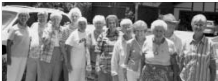
FL-8 at their May meeting.