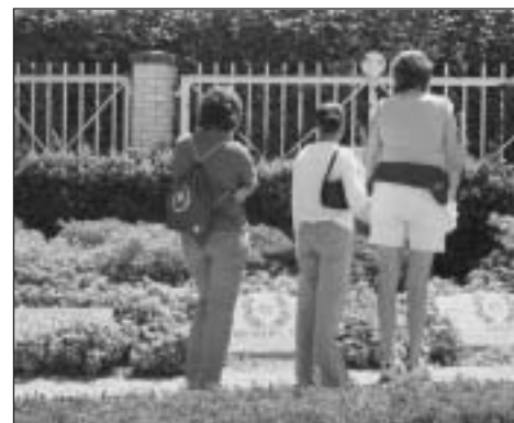
Kentucky Derby Walk of Champions, where only the head, heart and hooves are laid to rest. The head represents the will to win; the heart represents courage and the hooves represent speed.

We finished up our tour by going to the Finish Line Gift