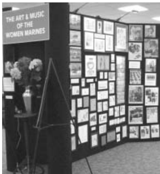
A small section of the History Suite in Louisville.

uniform items and awards that they did not rate nor were allowed to wear. These included the sam brown belt, WWI campaign medals, WWI campaign medals for service in France as well as gallantry medals issued to Marines by the French