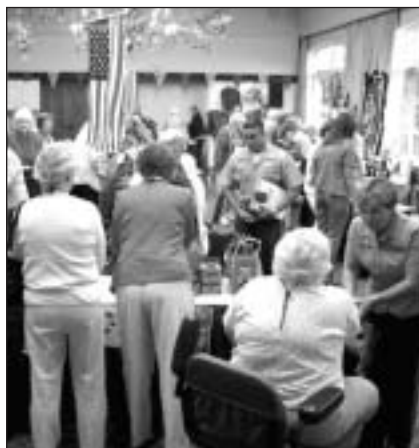
The "Tack Room", aka the WMA-PX, aka The Boutique.

Forwarded for all former military that may have an interest, and you should have an interest. The below "blurb" mentions employment, BUT you should also take your DD-214 with you when you apply for Social Security. Military service affects the amount you will receive, since the military made "extra contributions" on your behalf, and normally those do not show up in Social Security records.