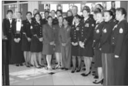
All our active duty Marines with the Commandant before the reception.