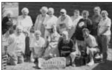
MA-1 at the Lobster Fest.