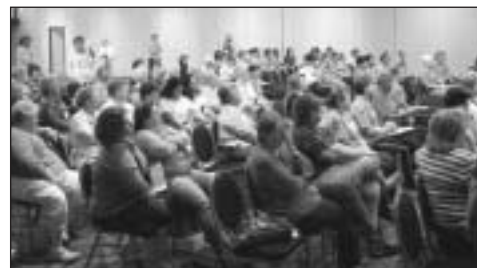
1st Timers Meeting