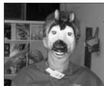
Who is that masked horse??