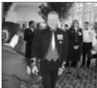
The Commandant of the Marine Corps making his way through the atrium of the Galt House.