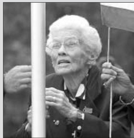
Patty Berg assists in raising the U.S. flag during the opening ceremonies for the 2002 Solheim Cup

The LPGA has announced two charities to which golfers may donate if they wish to make a memorial donation in her name. Denote on your check that the