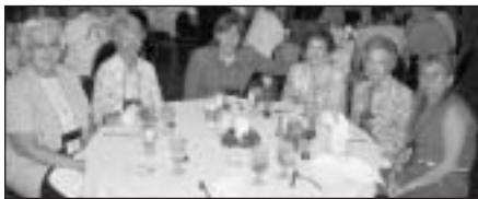
TX-2 at the installation luncheon.

and the book will be ready for sale by end of November 2007 (just in time for Christmas gifts).