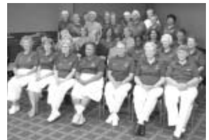
The Sometimes Singers at the Memorial Service.