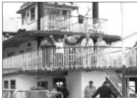
Aboard The Spirit of Jefferson

The Spirit of Jefferson Boat Cruise left the Louisville Port about 1900 after we loaded 150 members and guests aboard. Some of the ladies made their way up to the second deck, but the buffet dinner was served on the lower deck and boy, was that a wonderful and fulfilling meal. Our DJ played a variety of songs, allowing many of the ladies the opportunity to dance the night away.