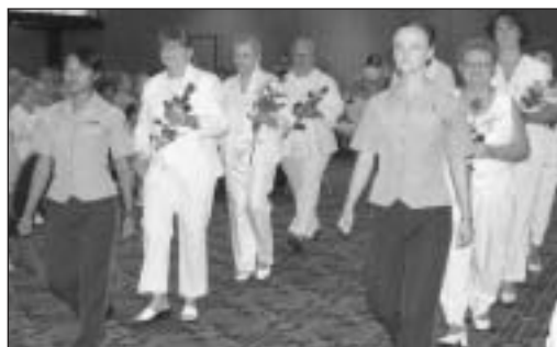
The pages escort the area directors to the head tables.