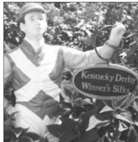
The lawn jockey with the winning silks, which are blue with green sleeves.