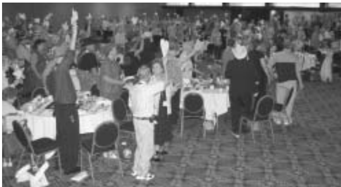
Audience participates for "Deep in the Heart of Texas"