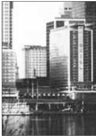
The Galt House in Louisville, Kentucky will be the site of our 24th Biennial Convention in September, 2006.

Originally built in the early 1800's, The Galt House has been welcoming guests for over 165 years. The 1,300-room hotel is well into