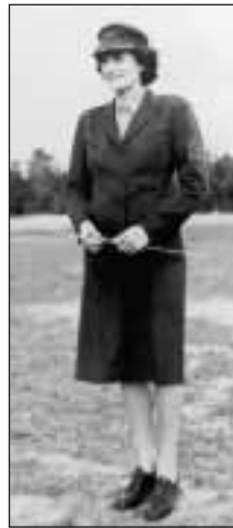
The leader of the band.