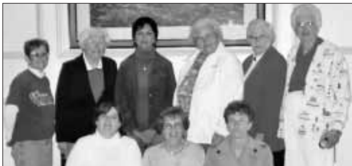
IN-1 members at our most recent meeting. The meeting was held in Indianapolis.

They say that "it is better to give than to receive". The Indiana Chapter agrees with this and we had a year of giving. We have donated funds to the Indianapolis VA Medical Center for the Women Veterans Clinic and we donated funds for a dialysis chair to the Indianapolis VA Medical Center. But, we didn't stop there; we also donated funds to the local chapter of the Young Marines, the Injured Marines Semper Fi Fund and to Volunteer Services at the Indianapolis VA Medical Center. We look forward to another year of giving.