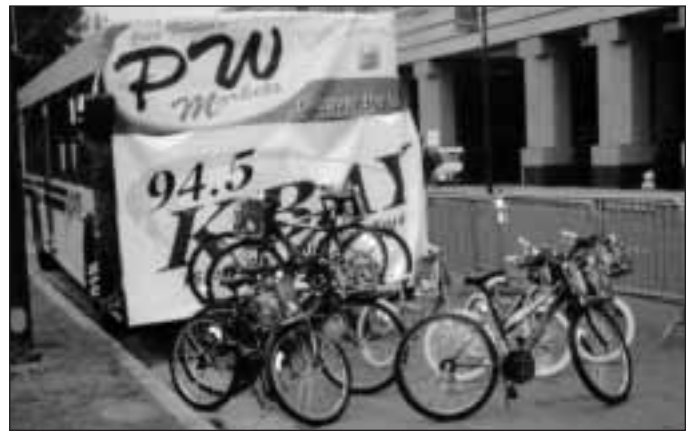
The Toys for Tots bus.