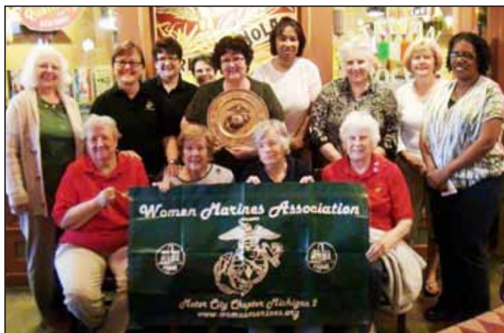
MI-2 at their last meeting

Time never seems to stand still for our chapter. We have welcomed new members and enjoyed the company of all of our members. Not all has been fun and games. From packing boxes for our troops to raising funds for the WMA National Fallen Warrior Women Marine Scholarship fund, this chapter has been on its toes.