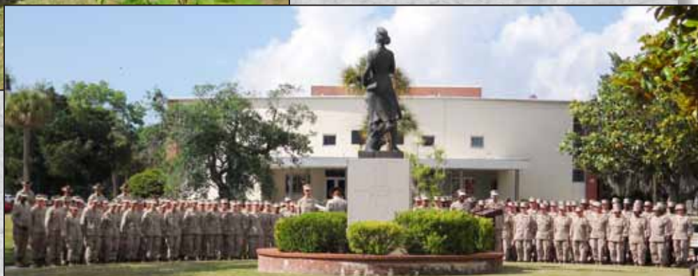
O Company following the Molly Marine Award presentation...OOO-RAH!