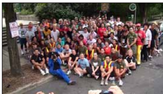
Fun Run-2012 Convention in Philadelphia. The group is gathered at the site of the original Tun Tavern.

the years I have reconnected with platoon commanders and instructors from my time in the Women Officer School at Quantico, recruits that I helped to train at Parris Island, women...and even a couple of men...that I worked with at Camp Pendleton, Camp Courtney, and Camp Elmore. Convention is business and banquets, panels and presentations, awards and applause, but most of all reuniting and remembering.