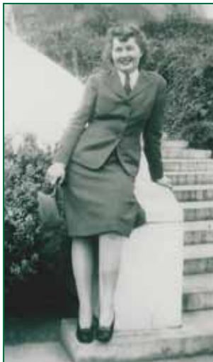
On liberty in Atlanta, July 1943.

During classes, we first learned about the physical aspects of the Link, which was named after its inventor, Edward Link. It was like a small piper cub with half the wingspan and sat on a vacuum box. It was controlled by the pilot in the cockpit moving the stick from side to side, forward or backward. The pilot was taught to climb, glide, or turn. There were maneuvers using Morse code "A" "N" signals when navigating the sky. We learned the mechanics needed to maintain and repair it. With that mastered, we learned to fly and perform the ma-