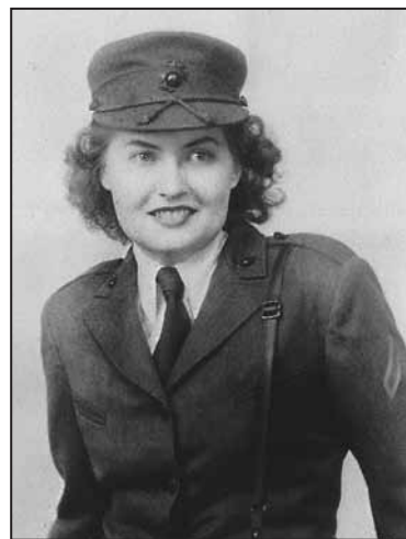
After Link Trainer school. Notice the PFC stripe I received upon completion.

My next hop was to Oklahoma City. Then I went on to Sedalia, Mo., where I caught a train to St. Joseph.