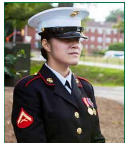
What do you think of the male cover with our dress blues?