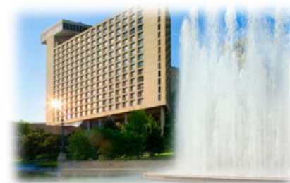
Westin Crown Center-Kansas City

Location: Located in Hallmark's Crown Center right off I-70