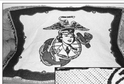
Our new throw!