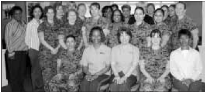
VA-1 at one of their work week luncheons.

In addition, we recently had a few chapter officers that needed to step down and when I put out the word that I needed a new treasurer, I got seven new members and four volunteers to assume leadership roles. We have added a monthly no-host luncheon during the work week at the club during the months that we do not have a major activity in an effort to reach out to more of our active duty Marines and had 25 at our luncheon today. We had spurred the EWS Captains to work on a draft mentorship program and order for EWS and we have a young major who is a Naval Academy graduate who is coordinating a mentorship program for the incoming Marine Option 2d lieutenants.