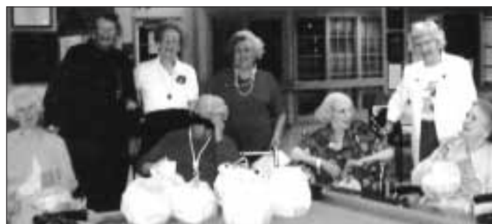
FL-9 with residents at the VA Home.

In January we held our first meeting since the holidays. It was fun getting together and sharing our adventures. We planned our