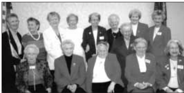
The WRs of OR-1.