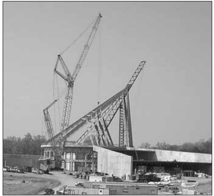
Construction of the main gallery in progress.

This segment of the museum will also include an orientation theater and a temporary photo gallery with pictures from the Persian Gulf War, Afghanistan and Iraq. Officials with the foundation use the term "immersion experience" in describing the atmosphere for the museum. They want people to get a sense of what it takes to be a Marine and a feel for life on the battlefield.