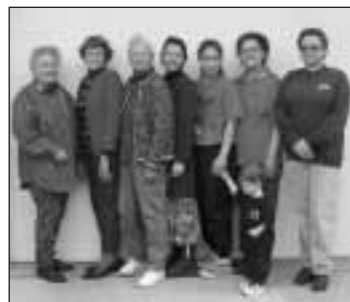
The members of CO-2.

CO-2 has been on a whirlwind start. In their first six months they raised enough money to send their president to the convention in San Diego. They also had a favorable presence on the Colorado Springs Marine Corps Ball Committee, which held their ball at the wonderful five-star Broadmoor Hotel.