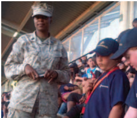
Hanible with children in Cleveland during Marine Week in 2012.