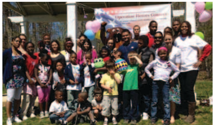
Operation Heroes Connect mentors and mentees.