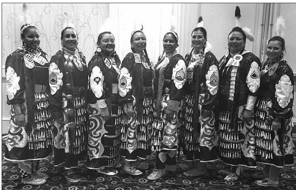
NAWW in their jingle dresses during an inauguration pow wow.

Native American women veterans made history in January when the Native American Women Warriors color guard marched in the inaugural parade in Washington, DC. NAWW is recognized as the country's first all-female, all-Native American color guard.