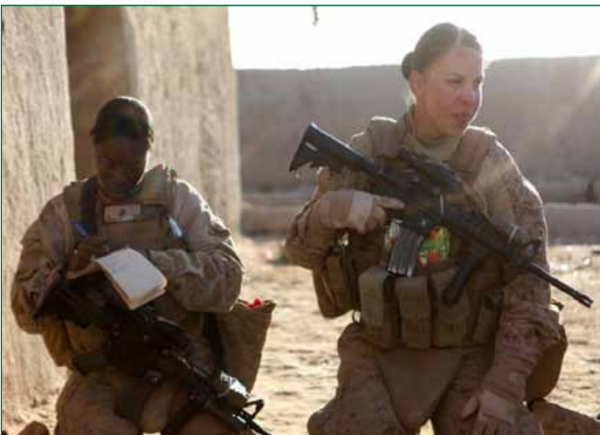
Vernice Armour's photo courtesy of www.zerotobreakthrough.com ; FET photo by Cpl. Marianne T. Mangrum

Opening up combat roles for women is merely formalizing the reality of what was already happening; it's just opening more roles and opportunities.