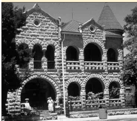
The Charles Schreiner Mansion