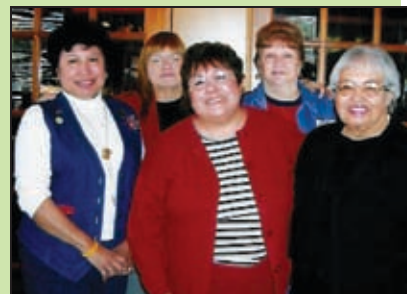
Having fun in Texas!