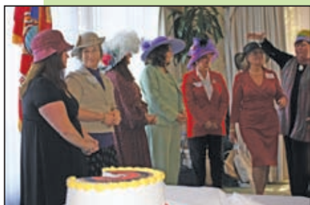
CA-7: The prettiest hat...