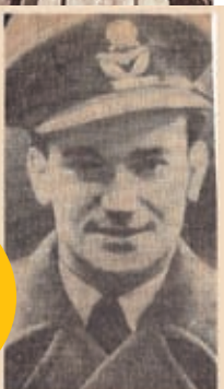
ACE KILLED — Brendan (Paddy) Finucane, famous R.A.F. pilot, meets death as bullet disables plane.