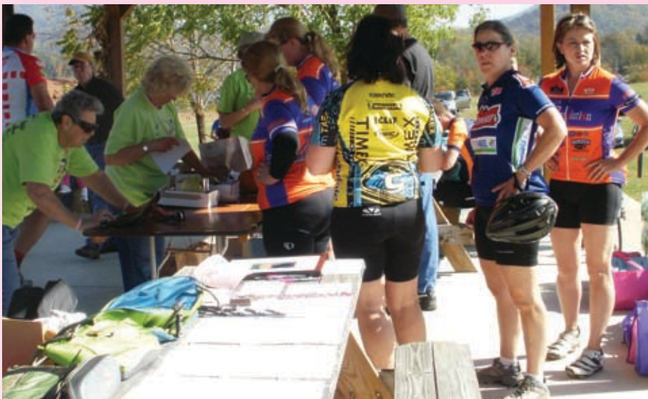
Registration, running smoothly and on schedule as promised.