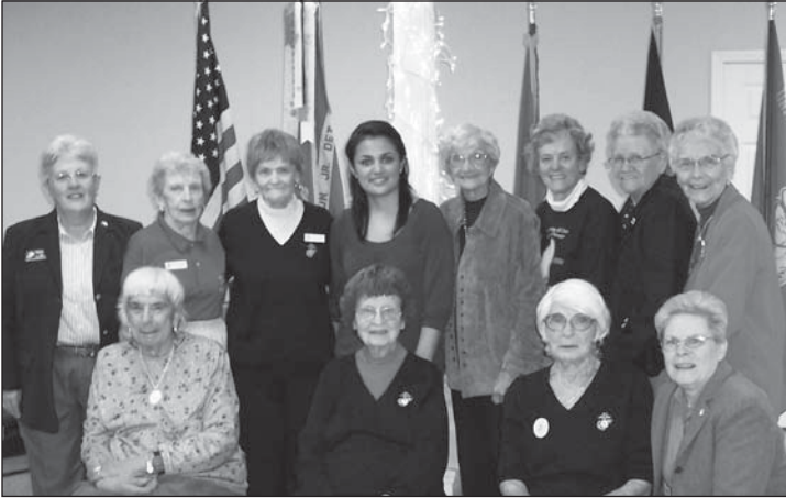
Twelve happy Marines at the FL-2 68th Anniversary Luncheon.