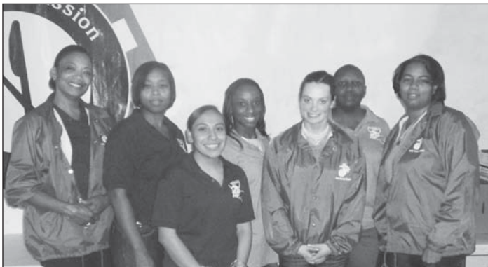
LA-1 Members volunteered to feed the homeless.