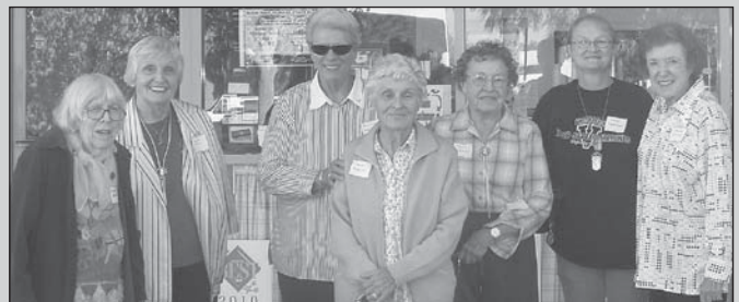
CA-15 members met recently in Lancaster.