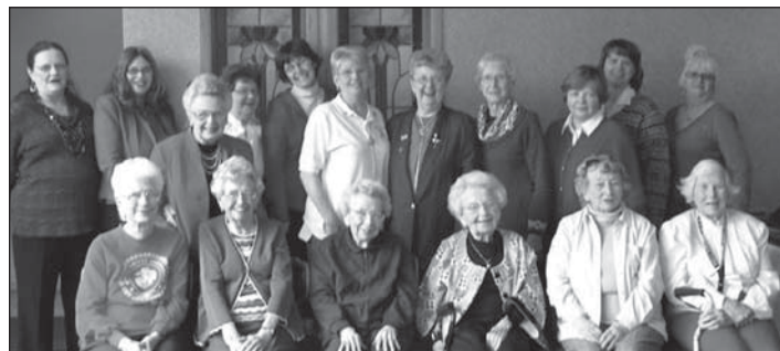
Caption needed for MN-1 Members photo.

On 12 February, a nice number of MN-1 members and guests met at Caspers' Cherokee Siroloin Room in West St. Paul, MN to celebrate the 68th anniversary of Women Marines.