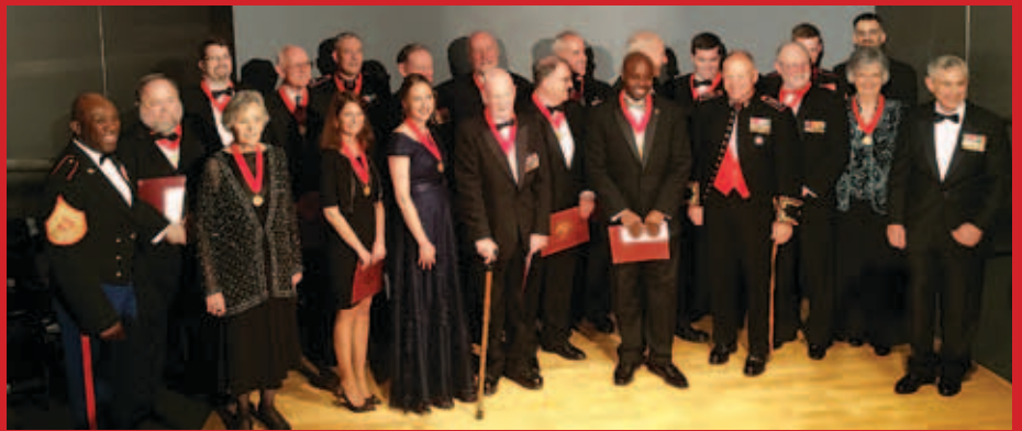
The evening's award recipients pose for a photo with the the Sergeant Major of the Marine Corps and the Commandant.