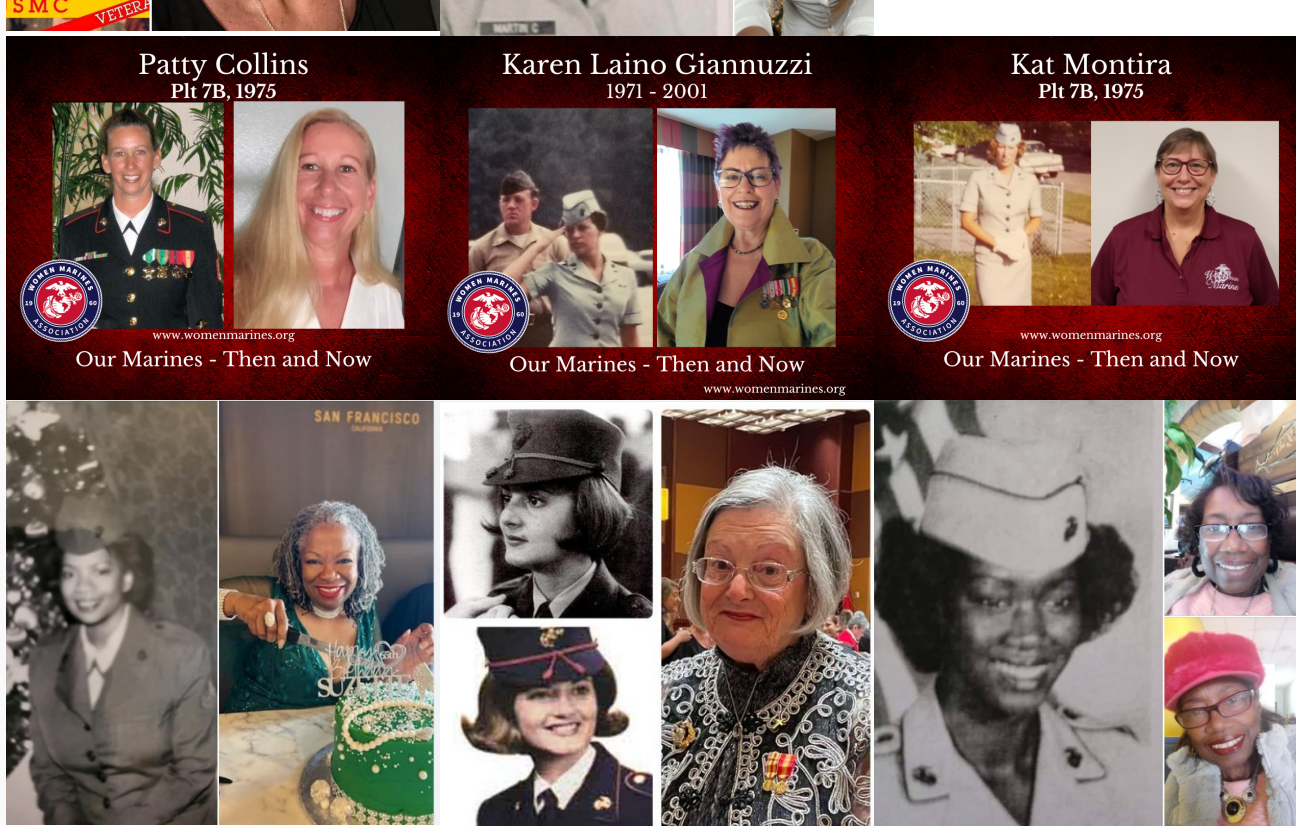
WMA would love to hear from you. Be sure to follow us on our links below.