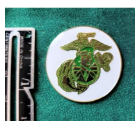
WMA Vintage Logo Pin