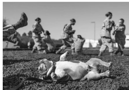
Pvt Bruno working on his martial arts training.

In the last issue, the new “recruit” at San Diego didn’t get a proper introduction. This is Bruno. He is taking over morale and ceremonial duties for Cpl Manny who is retiring to Philadelphia to live with another Marine who is also retiring.