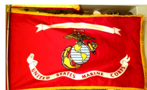
WMA Ceremonial Flag 3' x 5'