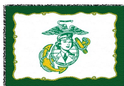
Vintage WMA Afghan