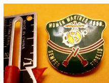
Cover Membership Pin

Chapter Ribbon (replacement). . . . $ 20.00