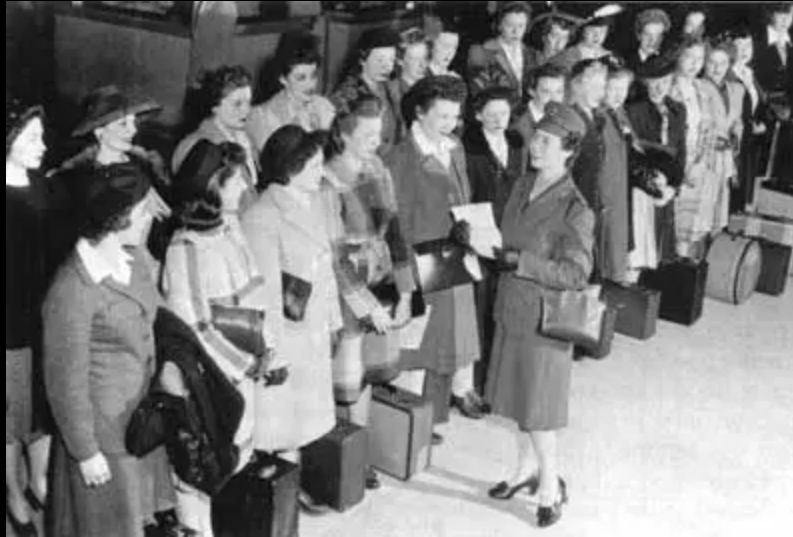
In February 1943 our first women lined up to go to Mount Holyoke on their journey to be a Marine.

Here it is: February. The Welsh call February "y mis bach"; which means "little month" and it is the third month of winter. For such a short month, there are so many events and holidays that are taking place: Groundhog Day, Anniversary of the Women Marines Reserve, Valentine's Day, Black History Month, the largest American sporting event of the year, the Super Bowl, Spunky Old Broads Month, Fat Tuesday and Mardi Gras just to name a few. And February also means Solmonath, "cake month". This is because cakes were offered to the gods during the month of February.