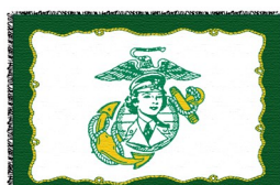
Vintage WMA Afghan