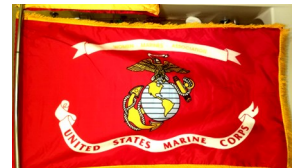
WMA Ceremonial Flag 3' x 5'