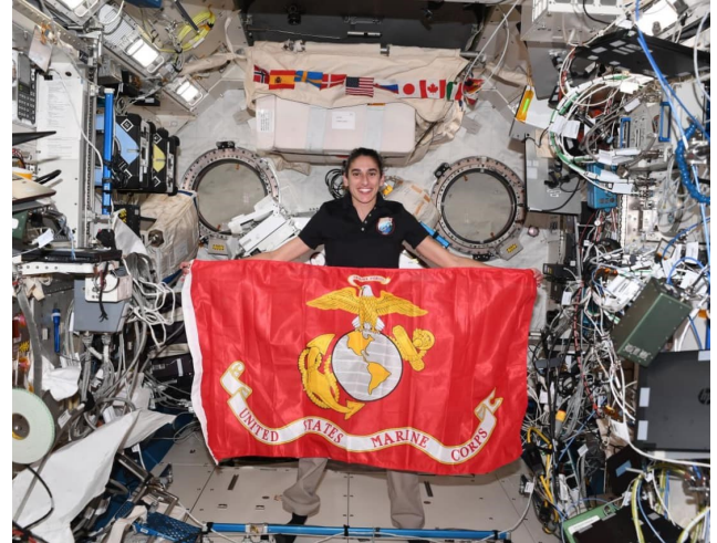
Our Marine-in-Space, LtCol Jasmin Moghbeli, celebrated the Marine Corps Birthday in the International Space Station and took a walk in space to do some repair work.