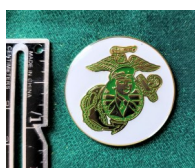
WMA Vintage Logo Pin