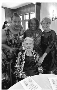
Top photo: Printzy with members of the DC-1 Chapter along with SgtMaj Robin Fortner, USMC (Ret.) (2 nd from left).