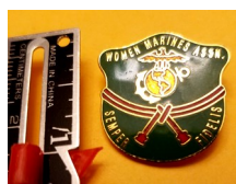
Cover Membership Pin

Chapter Ribbon (replacement). . . . $ 20.00