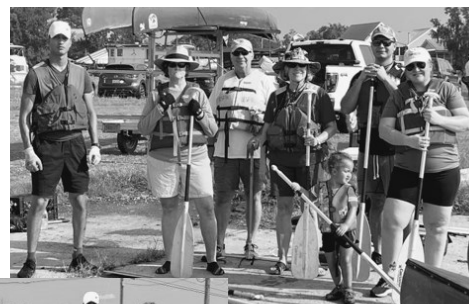
LA-1 Members at the Beach Sweep Clean-up at Big Branch Bayou

On September 16, the Chapter participated in a volunteer event at the Beach Sweep to clean-up.