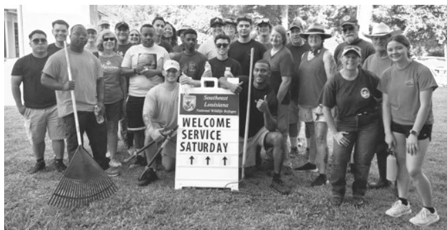
LA-1 Members at the Southeast Louisiana National Wildlife Refuge volunteer event